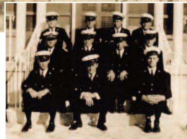
ABOVE: THE HISTORIC COAST GUARD STATION ON EAST BEACH