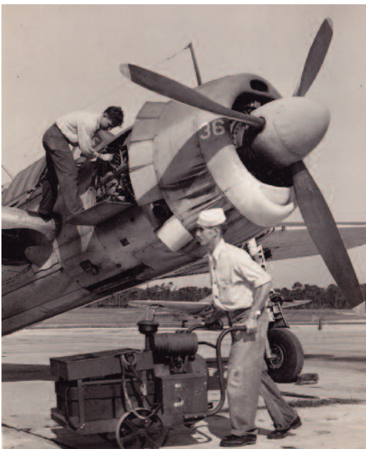
CIVIL AIR PATROL WORKERS AT MCKINNON AIRPORT ON ST. SIMONS ISLAND, 1942

FDR called America the "Arsenal of Democracy." Following Pearl Harbor, our area became an important component of that arsenal and contributed profoundly to winning the war.